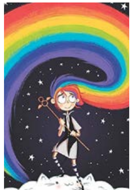
Illustration from Rainbow Grey